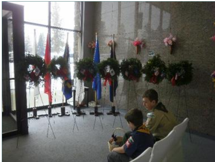
The armed Forces remembrance wreaths at the Pines Cemetery WAA event