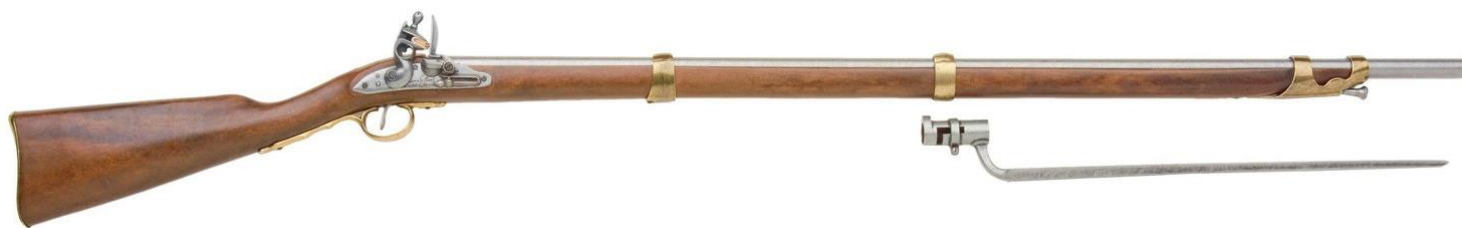
Charleville AN IX flintlock musket and Bayonet

More information on both offerings are available on page 13 and 14.