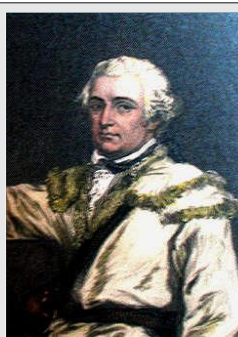
General Daniel Morgan

After a series of similar successes, Morgan left active service for a year, then joined the southern army under General Nathaniel Greene, where he was promoted to the rank of General. There his Riflemen's string of successes was capped when they were again pivotal in a key victory, the Battle of Cowpens.