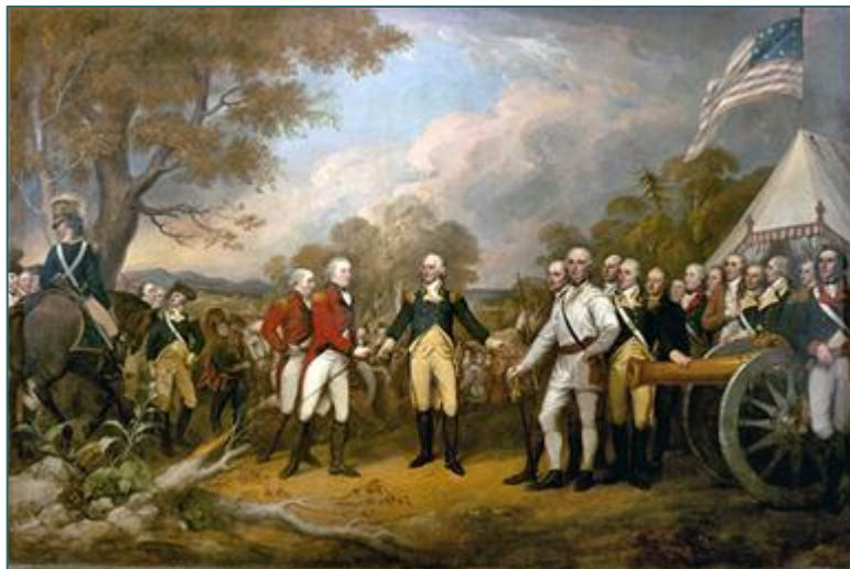
Surrender of General Burgoyne. Col. Morgan, having led his Riflemen in this victory, shown in white, right of center

Editor's Note: If you have a specific unit associated one or more of your Patriot Ancestors, the Unit Spotlight will be a reoccurring feature. Submit your draft to Editor at: emersonregoryd@gmail.com .