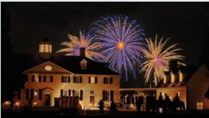
Christmas Illumination at Mount Vernon

Masthead – Noun – The title of a newsletter or magazine, at the head or top of the front cover or Editorial page.