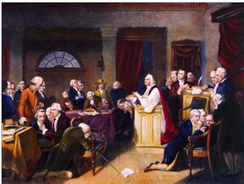
Opening the First Continental Congress with Prayer