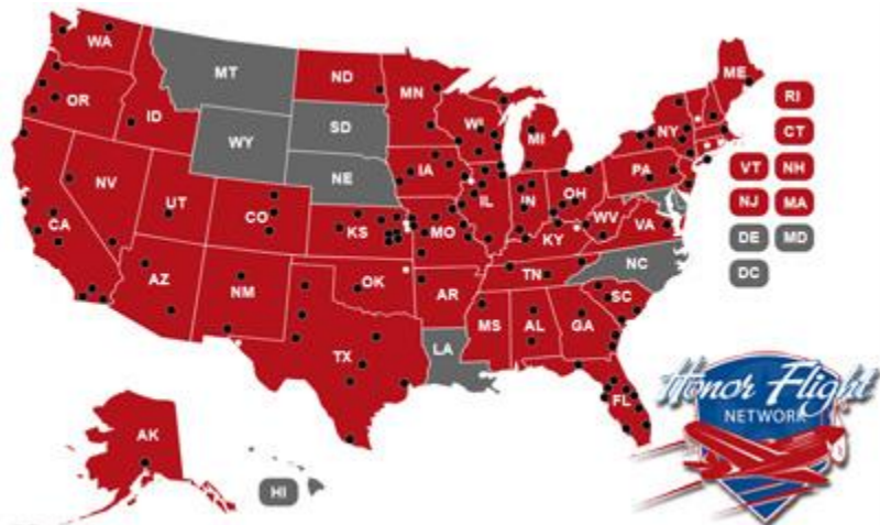
The Honor Flight Network Hubs

Washington State has two "hubs" in the organization's network - SeaTac International Airport in the Puget Sound region and Spokane International Airport, serving the eastern part of the state. If you would like more information on the Honor Flight Network and to learn how your chapter can participate in honoring the service of our veterans, check out their web site at: www.honorflight.org .