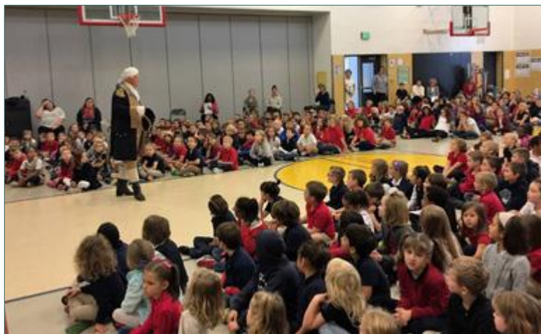
WASSAR friend General Washington sharing with Washington Elementary School students