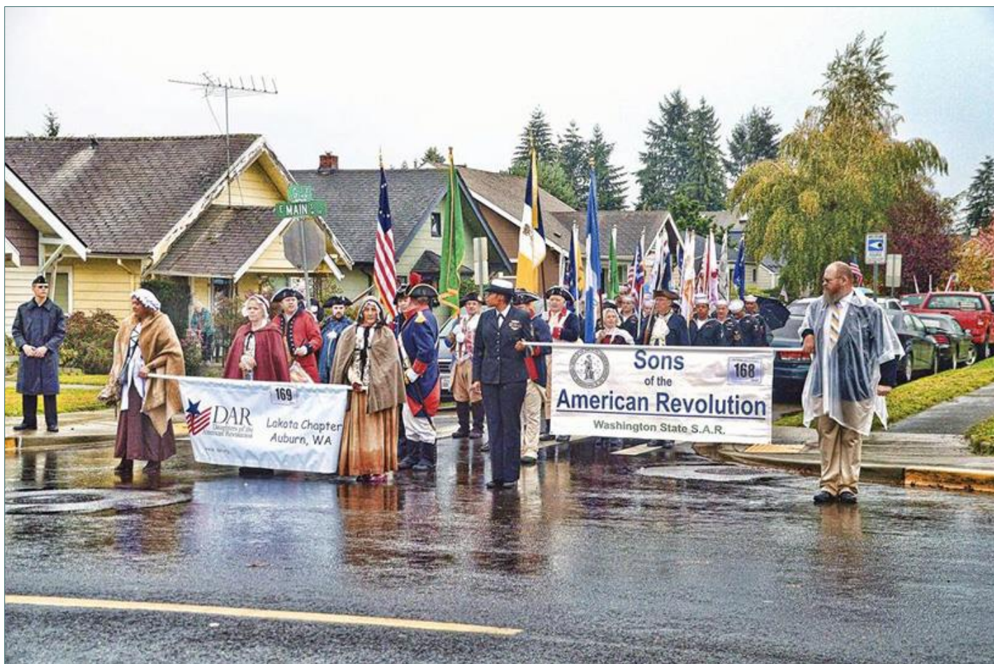
The WASSAR Color Guard Waits to March in the Auburn Veterans Parade

Print a few copies of the Washington Trail and ask to place them with other special interest flyers