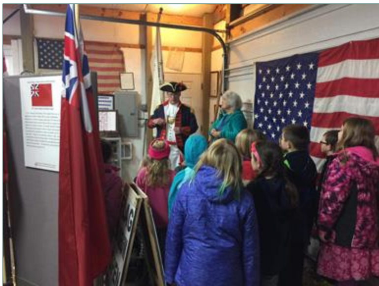
Students, teachers and parents from Pioneer Elementary school take a tour of the WASSAR Flag Museum